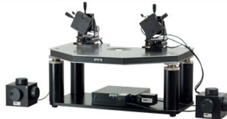
Two PCS-5400 Micromanipulators Mounted on Our Gibraltar GMHB-BX Platform