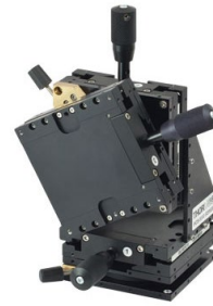
Click to Enlarge Micromanipulator Assembly

The headstage pivot allows for simple optimization of the pipette angle of approach on either an inverted or upright microscope. Additionally, the PCS-500-SSH Steep/Shallow Headstage Adapter or MIS-PHM Pipette Holder may be used in applications requiring very steep or shallow angles. Due to the symmetric design of our micromanipulator assembly, this system can be easily modified for a left-sided or orthogonal approach axis without needing a special adapter kit.