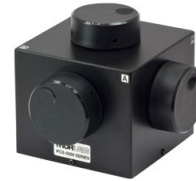
Click to Enlarge Axis Control Unit

Each knob controls a three-turn potentiometer, which regulates voltage to the piezo flexure assembly and thus its position. Three turns correspond to the full travel range of the piezo assembly, yielding a resolution that is 0.04% of the total piezo travel range. For example, a 150 \mu\text{m} piezo stage will have a 60 nm resolution provided by the axis control unit. Additionally, the user may set the potentiometer friction to suit experimental needs.